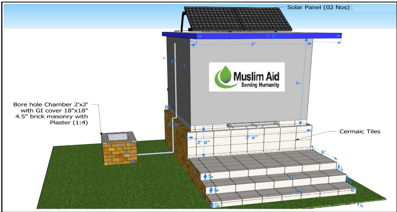
Construction of 01 Solarized Well with water storage tank