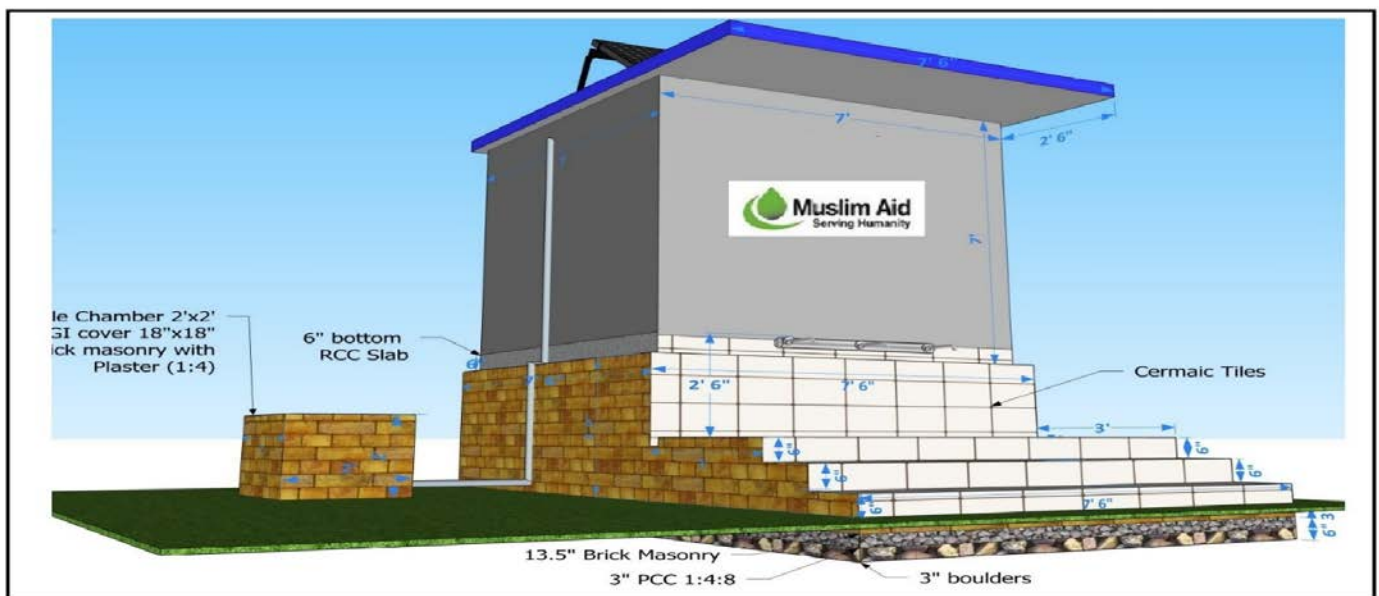
Construction of Solarized Well in Umar Kot Sindh